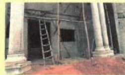
Thanks to your generosity the plastering of the walls of the new church in Nkanchi village has begun!